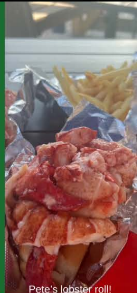
Pete's lobster roll!